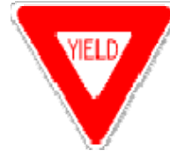
A yield sign

drivers, bicyclists and in-line skaters must complete stop at STOP signs. When there are pedestrians in the intersection and it is safe, you may go through the intersection.